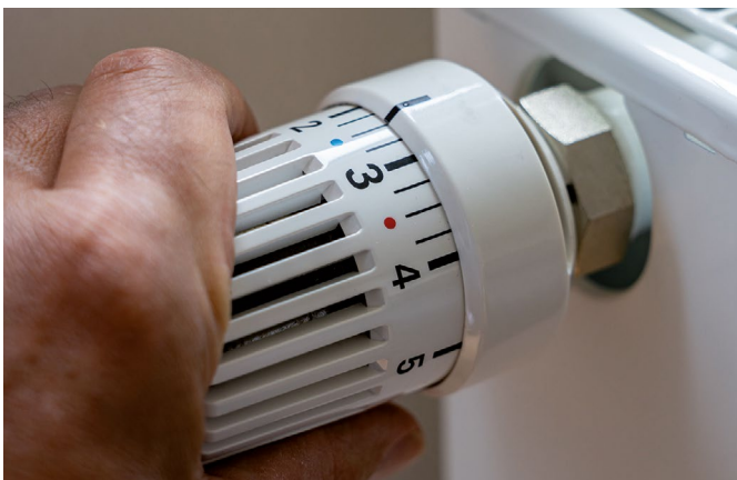
A thermostatic radiator valve, these can be turned up and down to adjust the temperature of the radiator.

The goal is still to try achieve as near as possible consistent internal temperatures. Achieving a lower temperature on a thermostat, say 18-21 degrees, for a couple of hours at a time will be better than blasting the heating up to 24 degrees for short periods and then turning it off once radiators are hot.